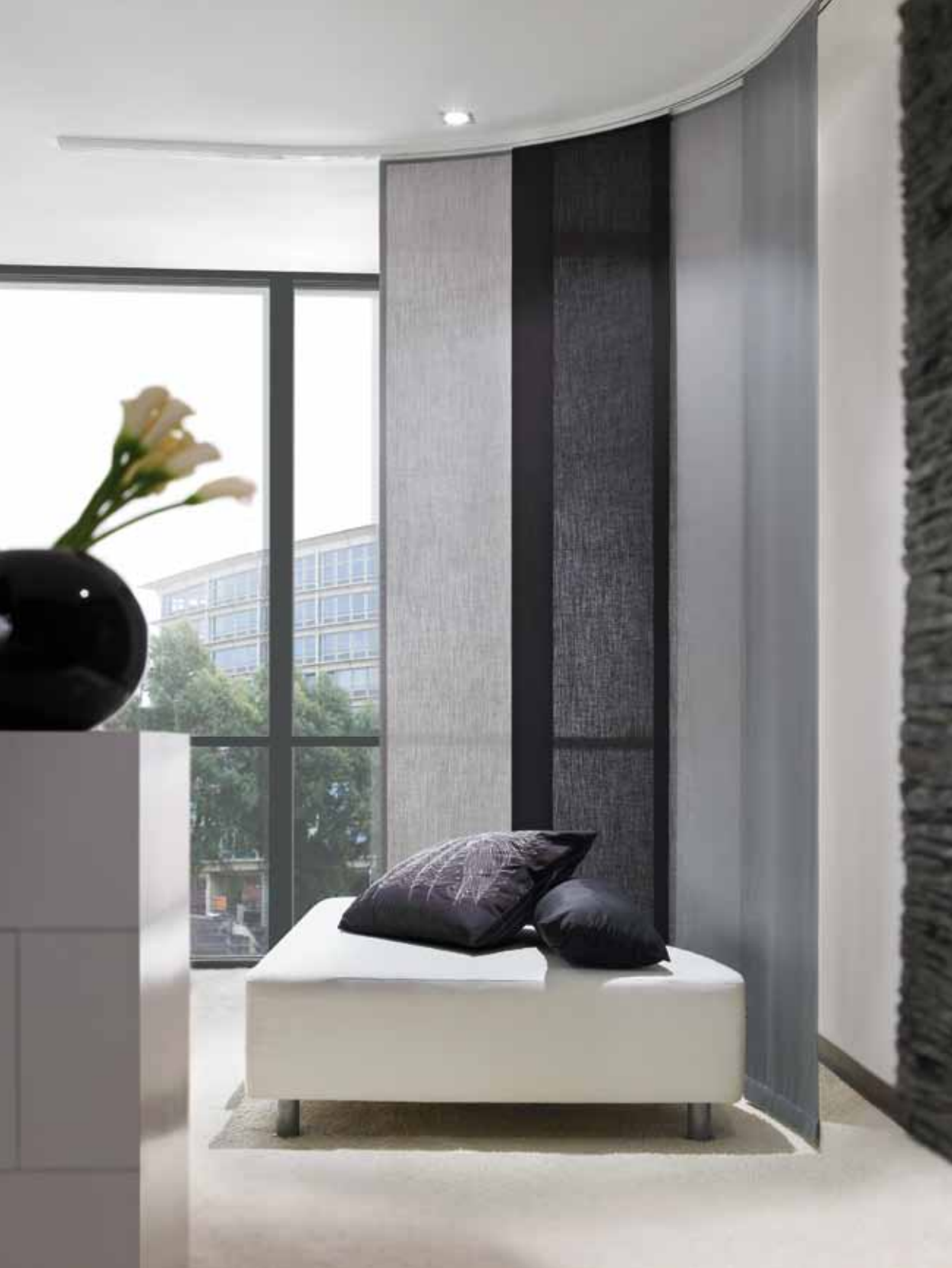
Curved Panel Glide System Silent Gliss 2730 Flex