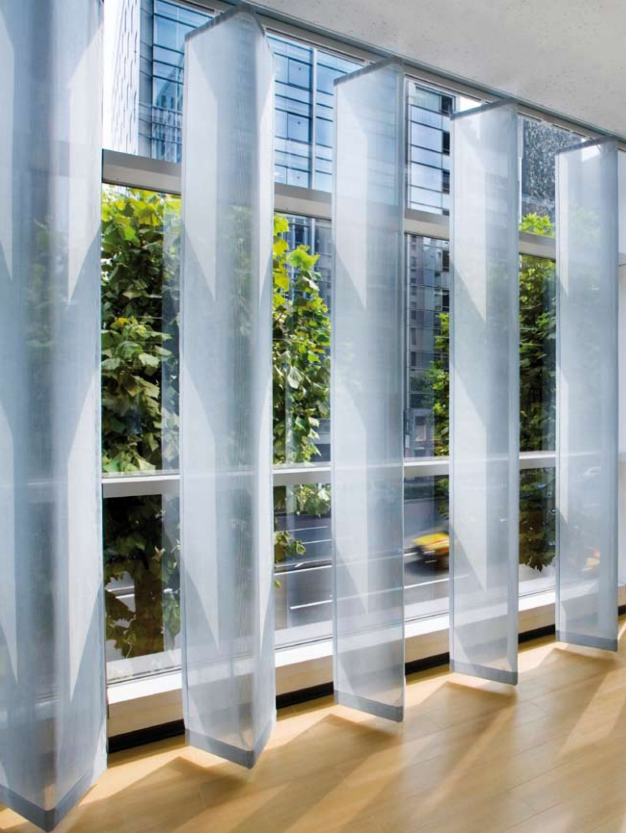
Silent Gliss Folding Panel